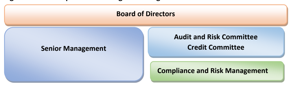
Figure 2. BPI Europe's Risk Management Organisation

Senior management, along with all front-line staff, as the first line of defence, is responsible for ensuring that they implement their management strategies within the risk appetite set by the Board.